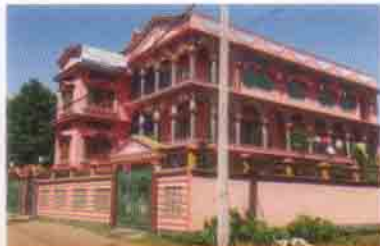
MARYAM AJMAL SENIOR SECONDARY SCHOOL, GAURIPUR