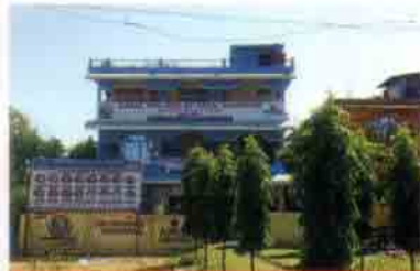
AJMAL SENIOR SECONDARY SCHOOL, GAURIPUR